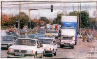
It can only get worse: congestion at Savoy Circus in Acton looking towards Shepherds Bush