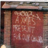
Not pretty: graffiti on one of the many boarded-up homes in Western Avenue

He said: "We are glad the scheme isn't going ahead, but we fear that the area will be built on again. We want it landscaped permanently."